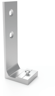
Item Code: FXN – 1010 – B – SM